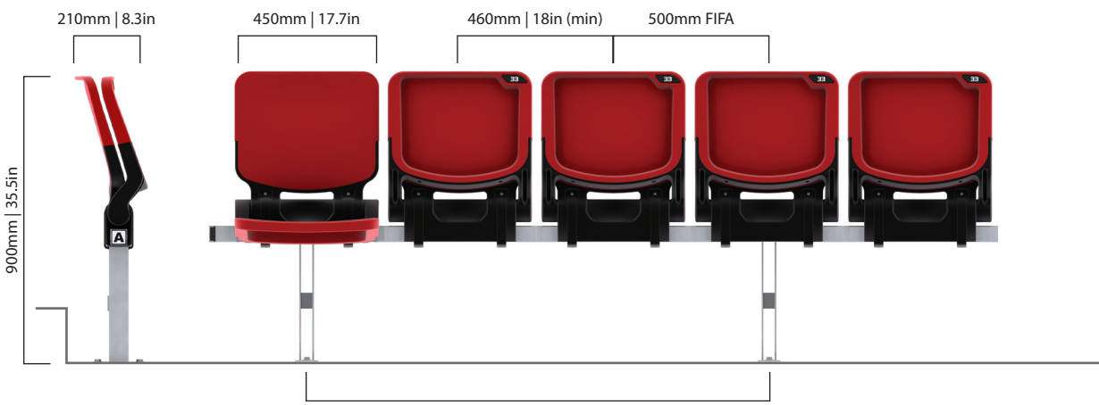
1500mm | 60in (Recommended)