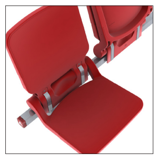
The BOX Seat range can all be colour coded. Additional stainless steel rail fixing straps are also available.