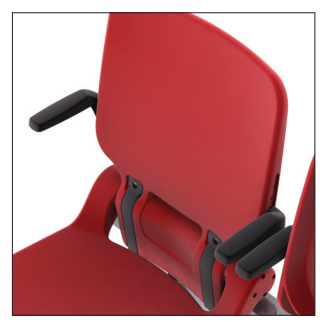
The BOX Seat 901 has a set of optional quick fix armrests and cupholders.